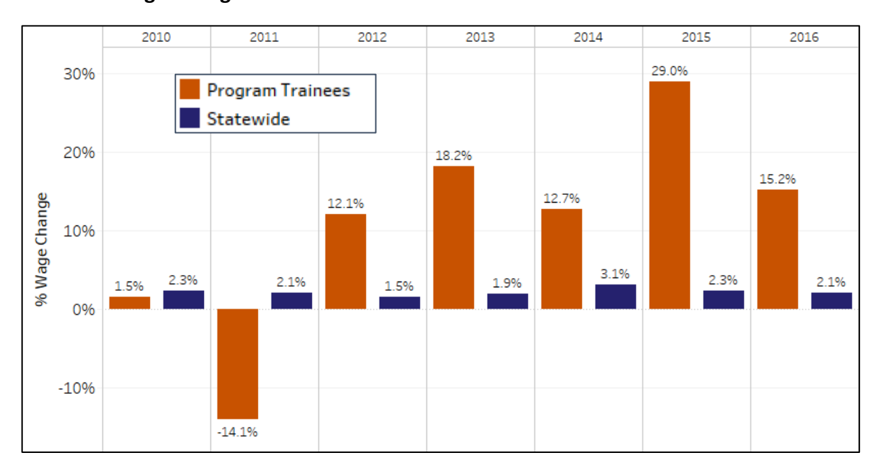
Chart 1. Annual Wage Change for WDTF Trainees and Statewide Workforce

Workers trained with WDTF grants reported annual average wage increases for every year except 2011. Wage change rates were below the statewide average in 2010 and 2011, however many Idaho businesses and workers were still recovering from the effects of the economic recession that ended in 2009 (Chart 1).